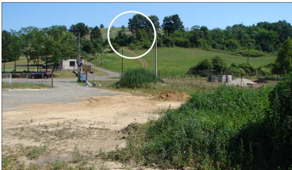
Fig 4. Habitat of Tosirips magyarus magyarus in Hungary, Komló-Mecsekjányosi (in 2007)

It can be imagined, that because of the effect of the global warming, the appearance of other new species may be expected. Unfortunately the habitat, at present in an agricultur-